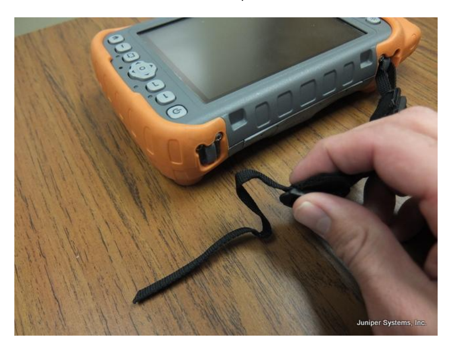
Slide one of the rings onto the hand strap tether.