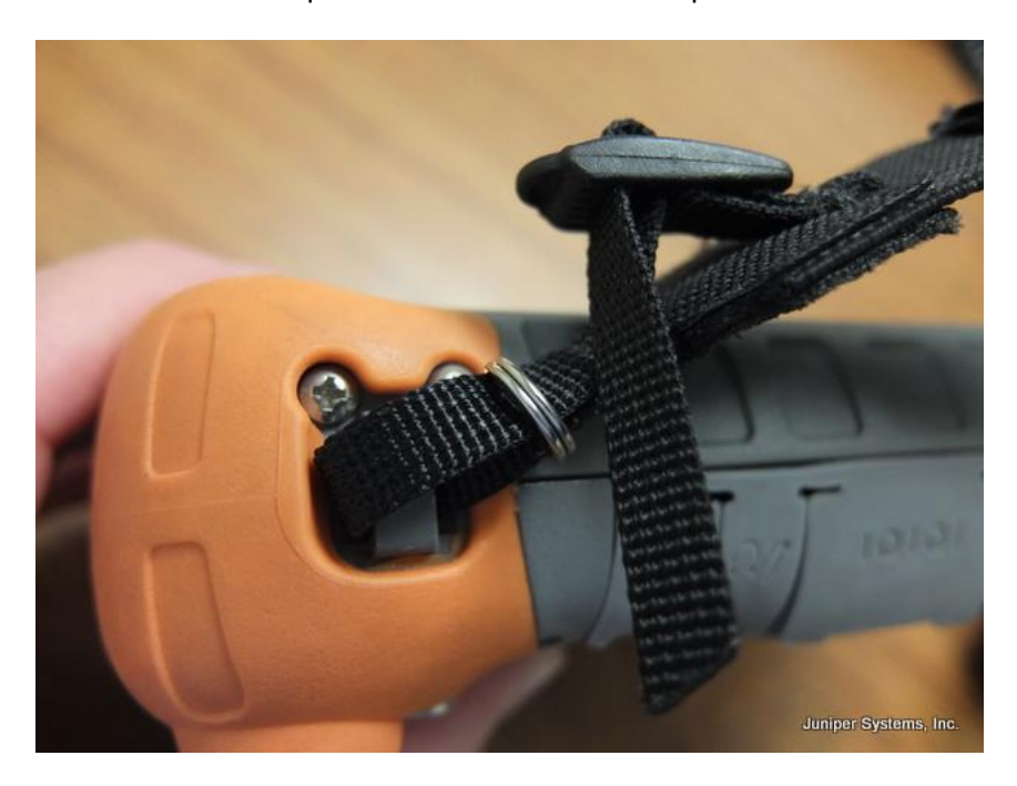
Repeat on the other end of the hand strap. You should now have a ring at each end of the hand strap.

Attach the hand strap tether end to the hand strap buckle.