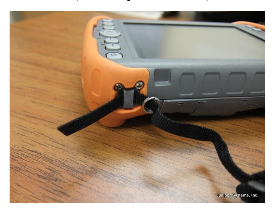
Slide the hand strap tether end back through the ring.

Slide the hand strap tether through the attachment loop on the Mesa.