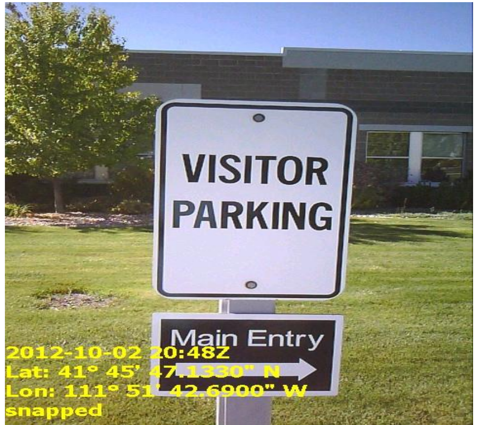
No Parking Signs 2