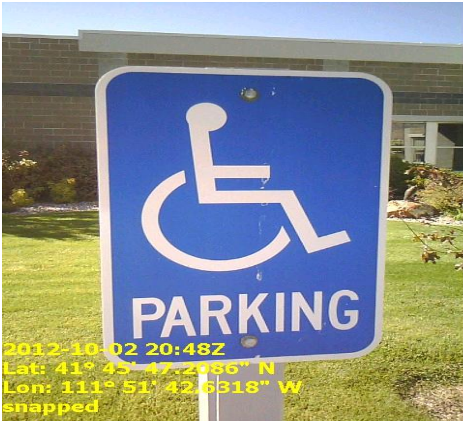
Traffic Signs 1